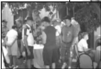
Visiting and renewing old acquaintances under the trees outside the hospitality room in Tucson.