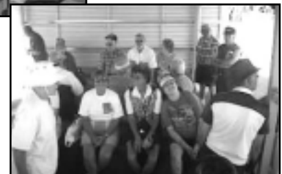
Reunion attendees at Pima Air Museum, awaiting bus for Boneyard tour.