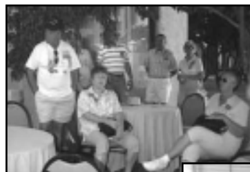
Relaxing under the trees outside hospitality room.