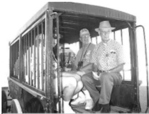
Reunion attendees at the Rodeo Museum get a ride in the historic jail wagon pulled by a pair of draft horses.

The U.S.S. Bainbridge's second inland reunion took place in the Sonoran Desert, the last weekend of September 2001 in Tucson, Arizona. Nearly 60 of your shipmates made the trip to Arizona to enjoy sunny, hot days crammed full of activities. This reunion was all the more special as it came in the wake of the horrific events of September 11, when many folks were forsaking airplane travel and staying close to home. Those who made the trek to Arizona agreed that our gathering was all the more significant as we came together to not only celebrate our Bainbridge years, but this great country we all served so proudly. It truly was a real red, white and blue event.